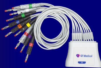
12 lead patient cable (1) Included