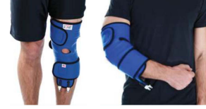
TMZ-003-17 Knee | Elbow Pad