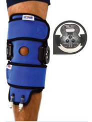
TMZ-003-47 Range of Motion (ROM) Knee Brace* *Insurance Reimbursable HPCS code L1833