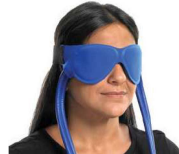
TMZ-003-12 Eye Pad