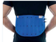
TMZ-003-18 Back, Abdomen, Hip Pad