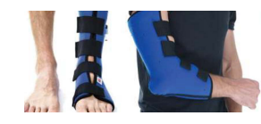
TMZ-003-19 Ankle | 90° Elbow Pad