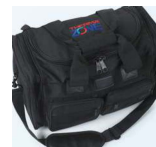
TMZ-003-05 Carrying Case (holds unit and 4 pads)