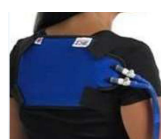
TMZ-003-22 Universal Pad