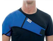
TMZ-003-15 Shoulder Pad Fits up to a 44" Chest