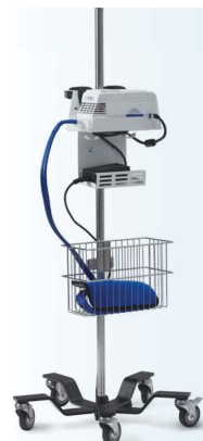
TMZ-003-43 IV Pole with Basket