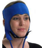
TMZ-003-10 Front & Side Head Pad

Individual pads work in conjunction with the ThermaZone Thermal Therapy technology and are interchangeable with the unit. Pads are universal and fit right or left side.