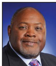
Mr. Gregory W. Porter We Care Honorary Festival Co-Chair