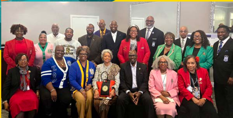
Representatives of the Divine 9 and other Non-profits in the Indianapolis community