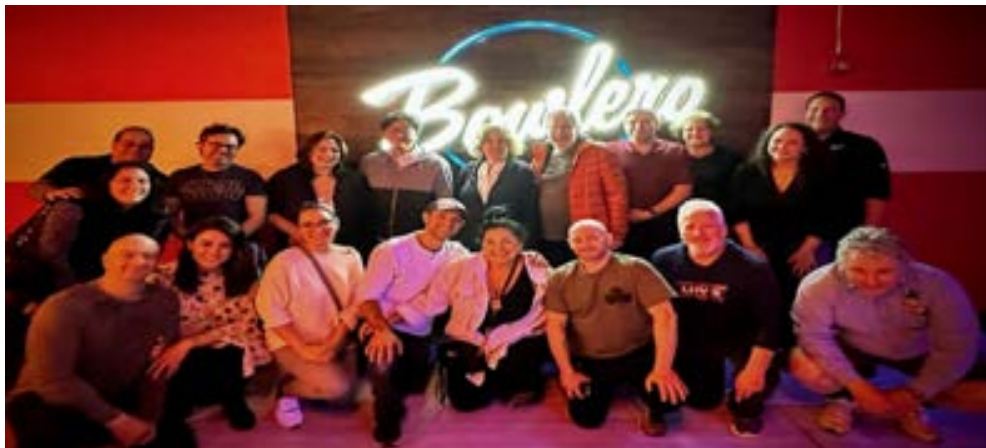
Whole group of attendees at the Bowling Night