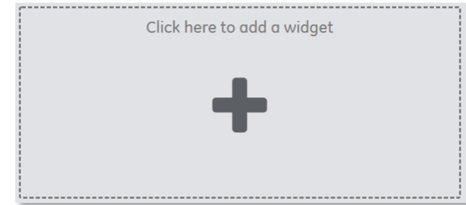
Add a new widget