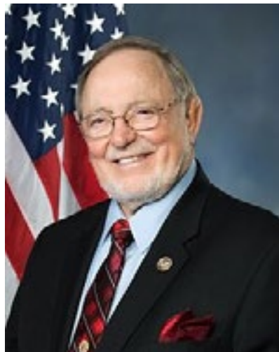
Rep. Don Young (R-AK)

the Chief of Staff with office operations. He also handles education issues and Alaska Native and American Indian affairs.