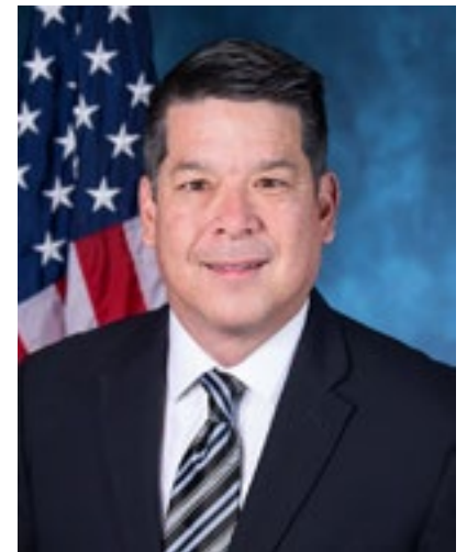
Rep. TJ Cox (D-CA)