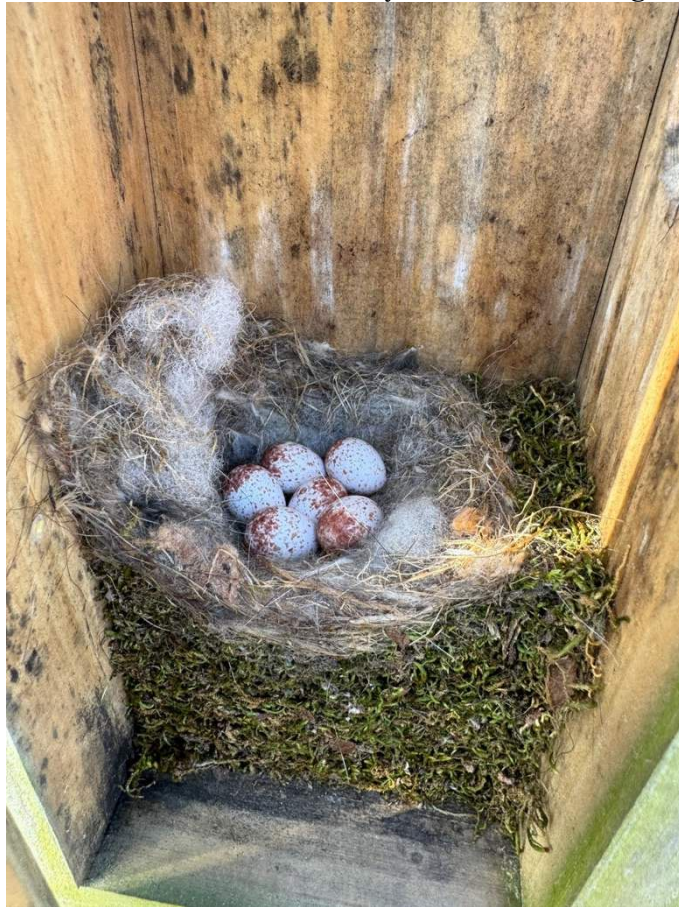
Carolina Chickadee eggs at Chickahominy Riverfront Park.

2024 marked the fifteenth year of monitoring Prothonotary Warblers at Northwest River