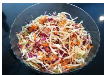
Our Famous Cole Slaw