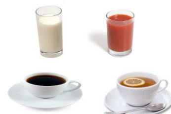
Coffee, tea, milk, tomato juice