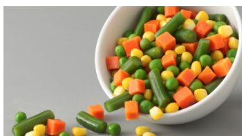
Buttered Mixed Veggies