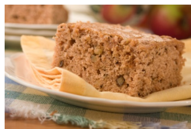
Apple Sauce Cake