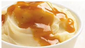
Real Mashed Potatoes w/ Gravy