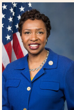
REPRESENTATIVE YVETTE D. CLARKE (NY-06)

Next Century Cities is focused on supporting local efforts to bring broadband within reach for every resident in every community. The coronavirus pandemic and ongoing calls for equality have only accelerated our timeline for making that goal a reality. We believe that citizens, policymakers, lawmakers, and providers must all claim a piece of addressing the digital divide. In our new video series, Ten Minutes with a Changemaker, we asked local, state, or federal officials to discuss connectivity challenges in their communities and ways to build strong digital infrastructure for future generations.