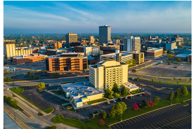
South Bend, IN

U.S. Representative G.K. Butterfield introduced the Expanding Opportunities for Broadband Deployment Act (H.R. 7160) on June 11th. If passed, the Bill would eliminate existing requirements that only internet service providers designated as eligible telecommunication providers can receive Universal Service Funds (USF), enabling more providers to participate in the Federal Communications Commission's Universal Service Fund programs. Striking down this existing barrier would accelerate broadband deployment to unserved and underserved communities.