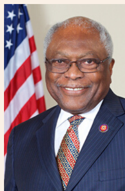
MAJORITY WHIP JAMES CLYBURN (SC-06)

If we do not act to close the urban-rural digital divide and we settle for federal and state policies that allow rural areas to get second-class service compared to cities and suburbs, then we will have signed a death warrant for our small towns and communities.