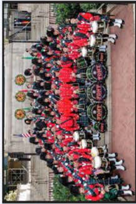
The FDNY Pipes & Drums