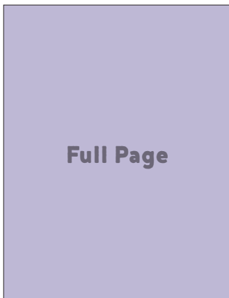
Trim Size - 8.5" x 11" With bleed - 8.75" x 11.25"