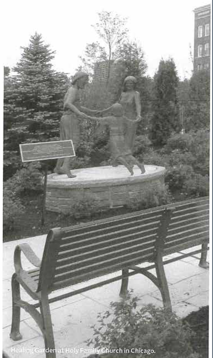
Healing Garden at Holy Family Church in Chicago.

Office for Assistance Ministry (OAM) personnel reach out and extend supportive services to victims-survivors from the moment they come forward with an allegation of clergy sexual abuse. This includes traveling throughout the country