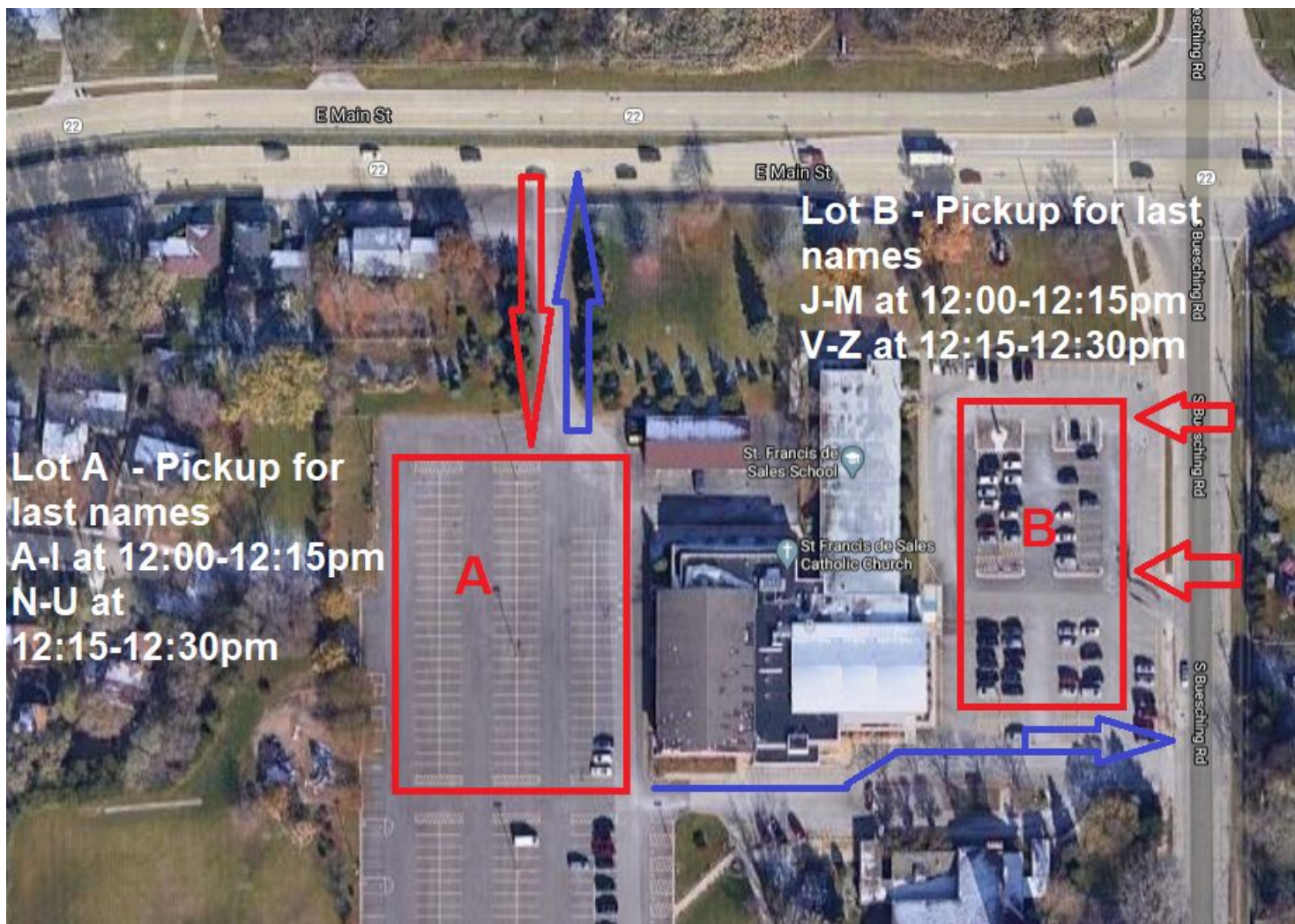
Map for Half Days (Including Monday 8-17-2020)