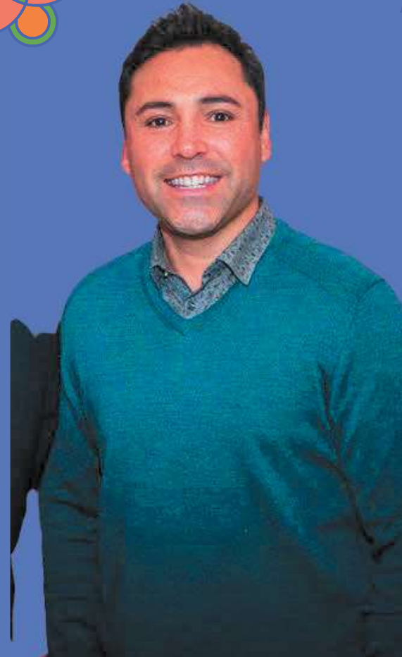
Oscar de la Hoya

Boxing champion and Olympic gold medalist.