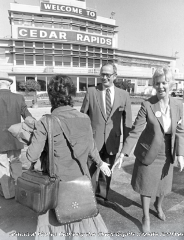
Historical Photos Courtesy the Cedar Rapids Gazette Archives