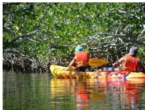
Kayaking the Florida Everglades