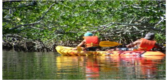
Kayaking the Florida Everglades