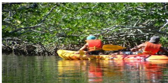
Kayaking the Florida Everglades