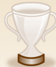
To Be Announced Realtor of the Year Realtor-Associate of the Year

Thursday, October 18, 2018 EXCELSIOR GRAND