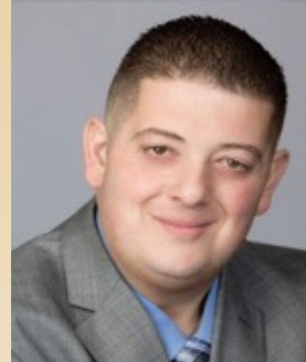
Massimo DiDonna Community Service Award