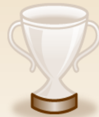
To Be Announced Realtor of the Year Realtor-Associate of the Year

Thursday, October 18, 2018 EXCELSIOR GRAND