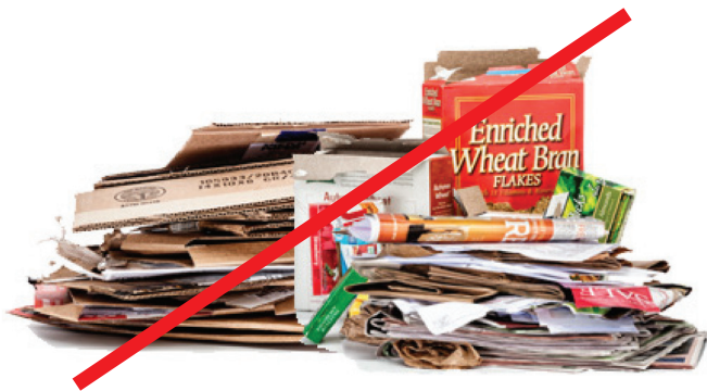
Cardboard & Paper