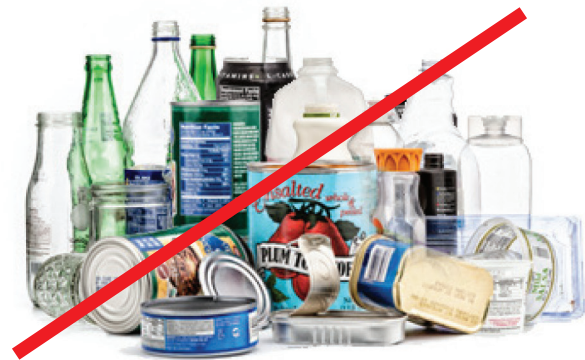
Glass, Metal & Plastic Containers