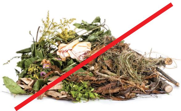
Leaves & Yard Waste