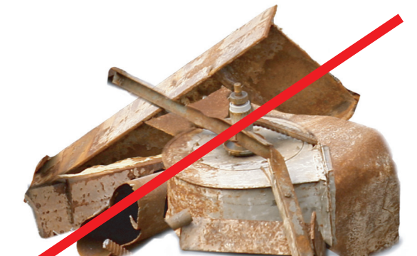
Ferrous & Non-Ferrous Metals