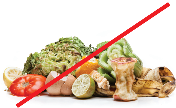
Commercial Food Waste (Businesses or institutions disposing one ton/wk or more)

Massachusetts Department of Environmental Protection regulation 310CMR 19.017 has banned the following items for disposal at landfills and combustion (except wood) facilities. Additionally, these items are banned for transfer for disposal from transfer stations and construction and demolition facilities. These items must be handled separately.