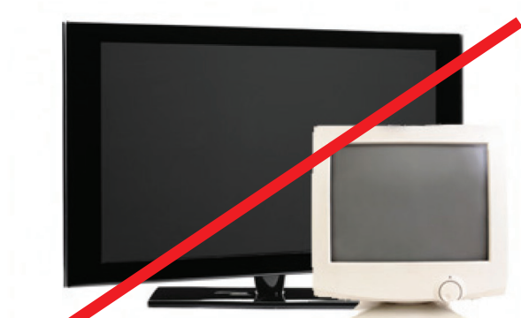
TVs, Computer Monitors & CRTs

ALSO BANNED: clean gypsum wallboard, vehicle tires, major appliances, (i.e., refrigerators, washers/dryers, freezers, a/c, ovens, microwaves, hot water heaters, etc.)