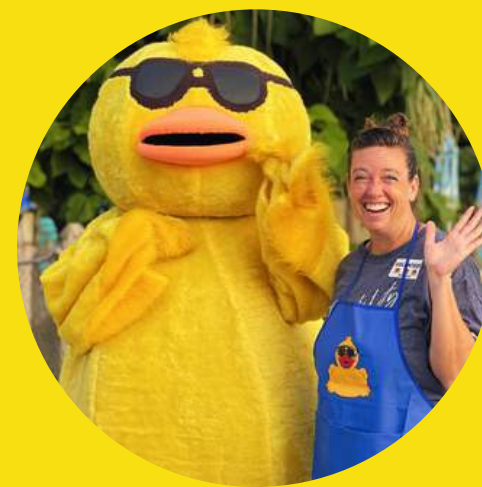
The Alpha Group opened 55 years ago!