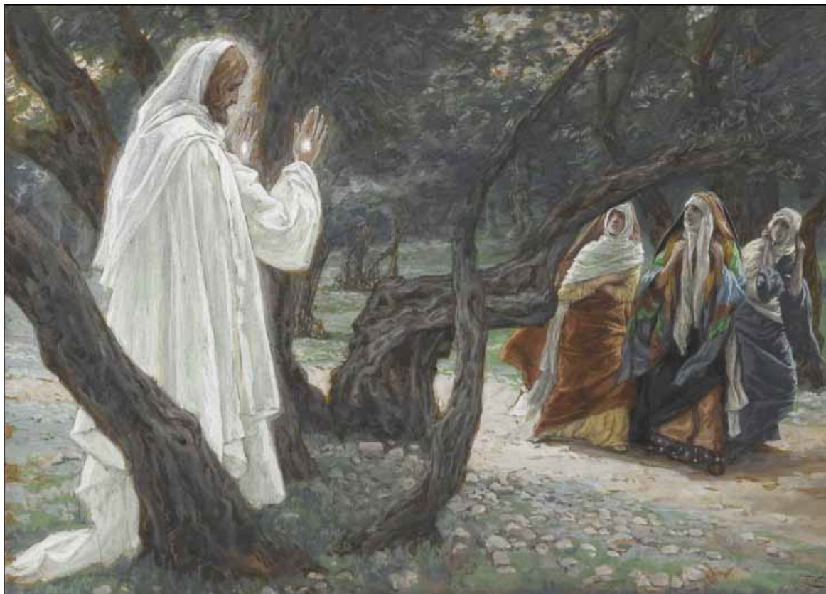
Jesus Appears to the Holy Women – James Tissot (1836-1902)