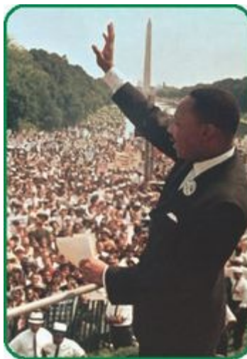
King gives "I Have a Dream" speech to a large crowd in Washington, D.C.

When King was growing up, the laws in some places were unfair. Those laws treated African American people differently from white people. African Americans were not allowed to go to the same schools as white students. Many were also forced to sit in the back of buses.