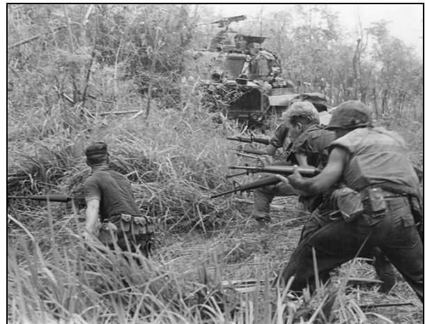
"U.S. Marines in Operation Allen Brook in 1968" by U.S. Marines (Official Marine Corps Photo #371490) is in the public domain.