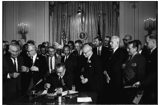
"Lyndon B. Johnson signing Civil Rights Act, July 2, 1964" by Cecil Stoughton is in the public domain.

Although the 13th, 14th, and 15th amendments outlawed slavery, provided for equal protection under the law, guaranteed citizenship, and protected the right to vote, individual states continued to allow unfair treatment of minorities and passed Jim Crow laws 1 allowing segregation of public facilities. These were upheld by the Supreme Court in Plessy v. Ferguson (1895), which found state laws requiring racial segregation that were "separate but equal" to be constitutional. This finding helped continue legalized discrimination well into the 20th century.