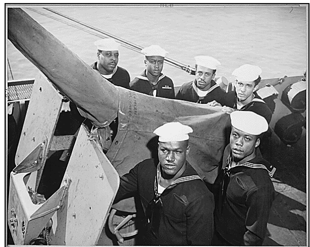
"Untitled" by United States Navy is in the public domain.

As America prepared for war, civil rights leader A. Philip Randolph threatened to organize a march on Washington to protest segregation and discrimination in the armed forces and defense industries.