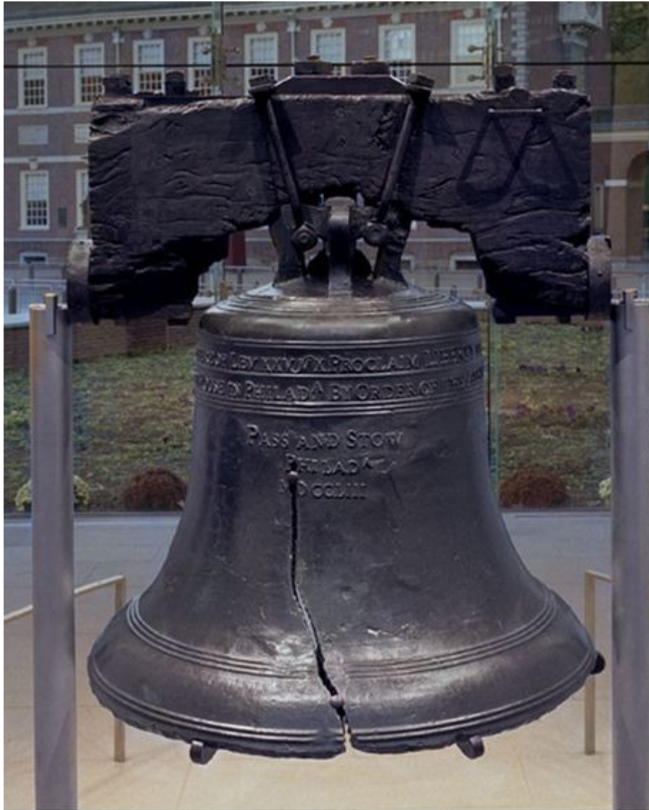
Liberty Bell in the Liberty Bell Center.

The United States of America has some special symbols. A symbol is something that stands for something else.