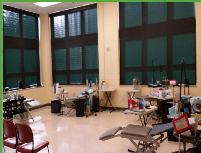
DENTAL TEAM: LICENSED DENTIST, DENTAL HYGIENIST, AND ASSISTANT