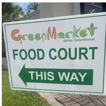
Delray Green Market