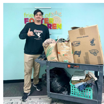
Grandview Preparatory School