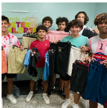
Community of Hope Youth Camp