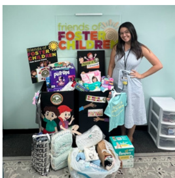
Primrose School of Royal Palm Beach