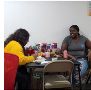
Creative Pursuits Workshop