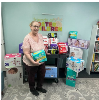
Kiwanis Club of Wellington