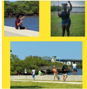
Kick-Off to Summer