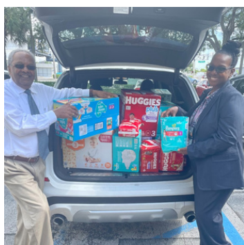
Kiwanis Club of North Palm Beach