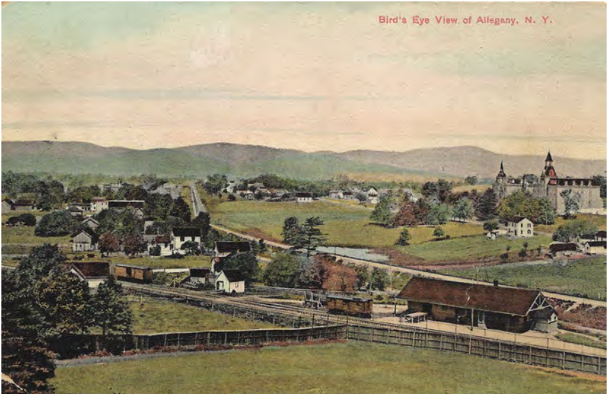
BIRD'S EYE VIEW OF ALLEGANY, NY. PICTURE POSTCARD, C. 1900. OLD ST. ELIZABETH'S MOTHERHOUSE IS VISIBLE IN THE BACKGROUND AT RIGHT. ALLEGANY TRAIN STATION VISIBLE IN THE FOREGROUND AT RIGHT.

1876) she was missioned in St. Anthony's in New York City were the only years she was not in Allegany. She had been the first teacher in the Town School, but for most of her time in Allegany she was teacher and principal of the Academy.