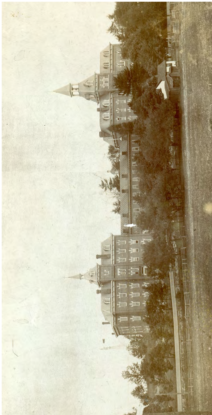
ST. ELIZABETH'S MOTHERHOUSE AND ACADEMY, C. 1898