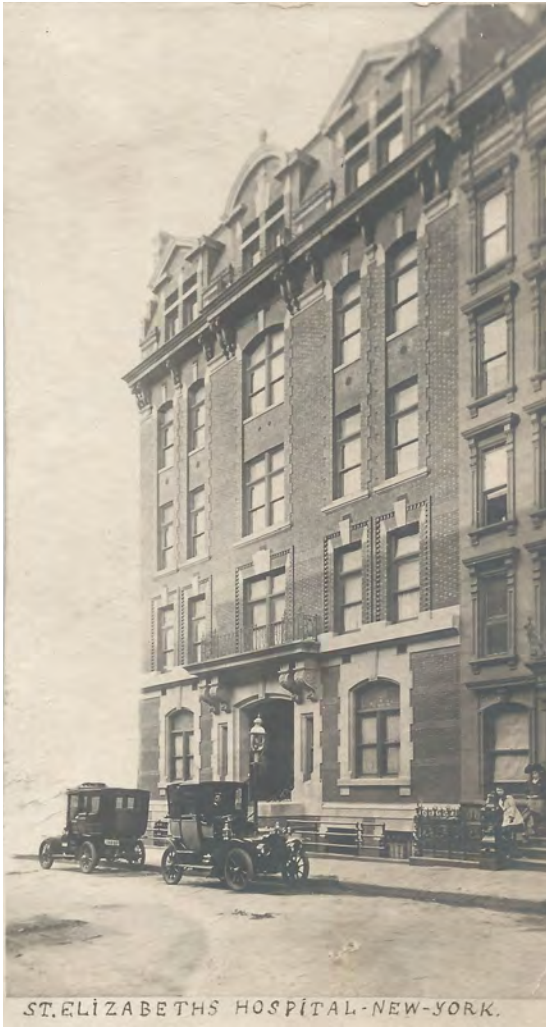
ST. ELIZABETH'S HOSPITAL, NEW YORK CITY, C. 1904. THE BUILDING LATER BECAME ST. CLARE'S HOSPITAL.

occasion. In 1919 her sixty years as a sister was celebrated with much less ceremony and the only memento of this jubilee in existence in the Motherhouse Archives is a very beautiful Spiritual Bouquet presented by the students of the Academy. Each spiritual offering is artistically printed and illuminated with floral designs done in exquisite pastel