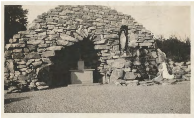
THE GROTTTO OF OUR LADY OF LOURDES STILL STANDS TODAY ON THE SITE OF THE OLD MOTHERHOUSE, NEAR ST. BONAVENTURE CEMETERY.