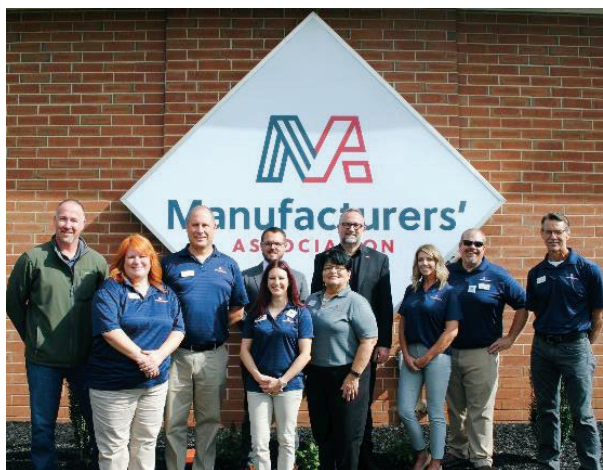
NEW BRAND. NEW LOOK. SAME MISSION.

The Manufacturers' Association's Board of Directors and organizational leadership identified an opportunity to update its logo, visual identity, and website to reflect this renewed commitment and highlight the image of modern manufacturing!