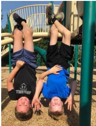
Summer Camp Shenanigans

Your Fundraiser Code: 120 Fundraiser Dates: 05/15/2018 to 08/31/2018