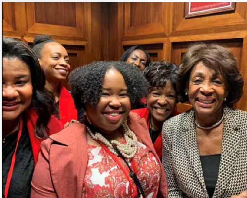
Representative Maxine Waters (D-CA) with NBNA Members