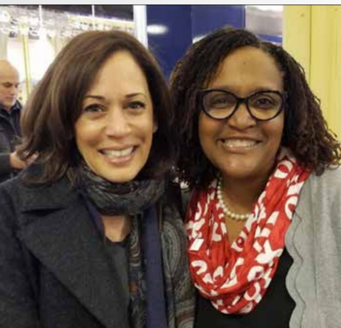
Senator Kamala Harris (D-CA) with NBNA Member