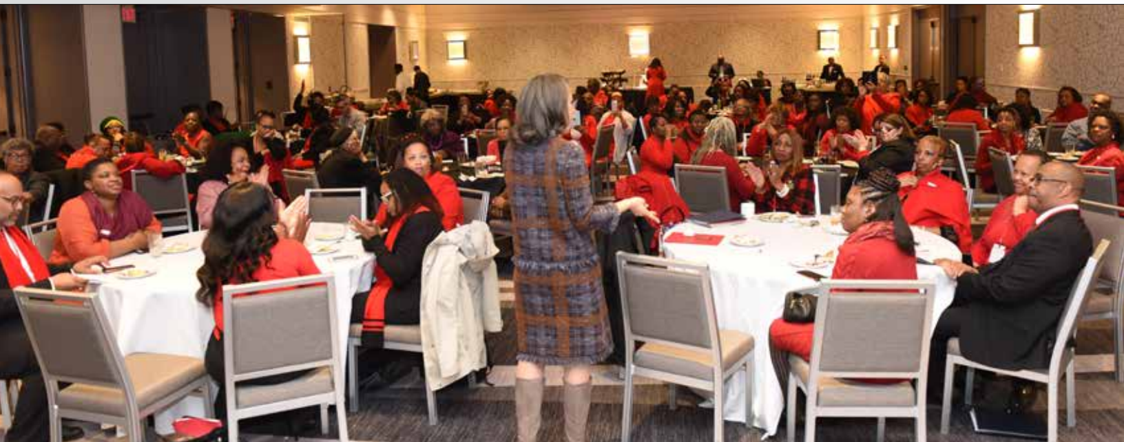
Rep. Lisa Blunt Rochester