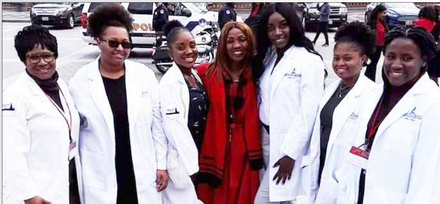
Morgan State University School of Nursing