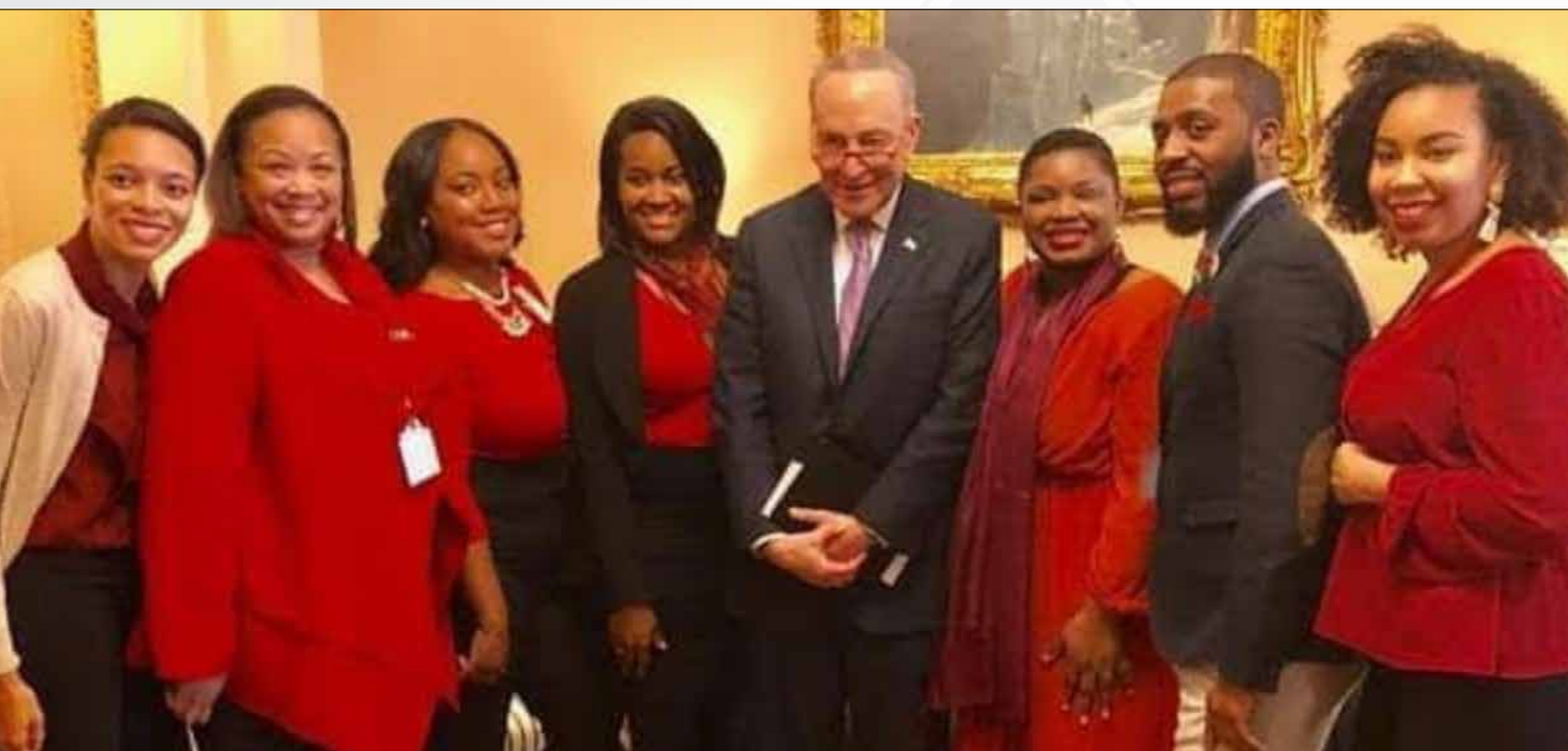
NBNA Members of the Greater New York City BNA with Senator Chuck Schumer of New York, Senate Minority Leader