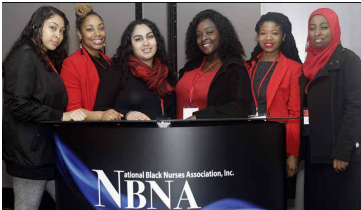
NBNA Day on Capitol Hill 2019 Attendees