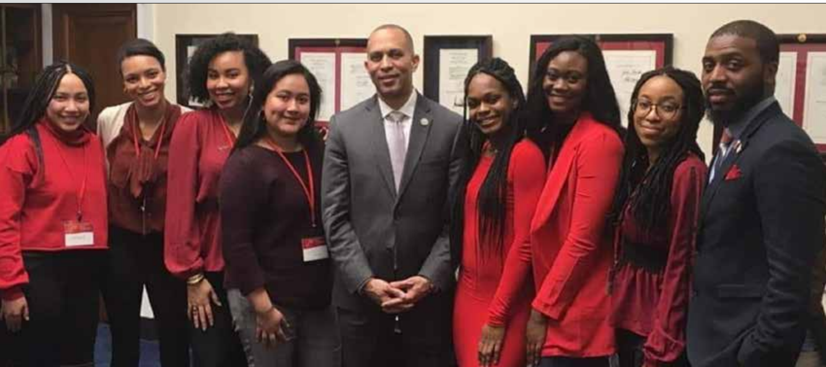
NBNA Members with Representative Hakeem Jeffries of New York