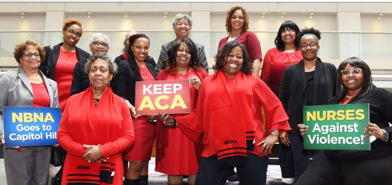
Southeastern Pennsylvania Area BNA at NBNA Day on Capitol Hill 2019