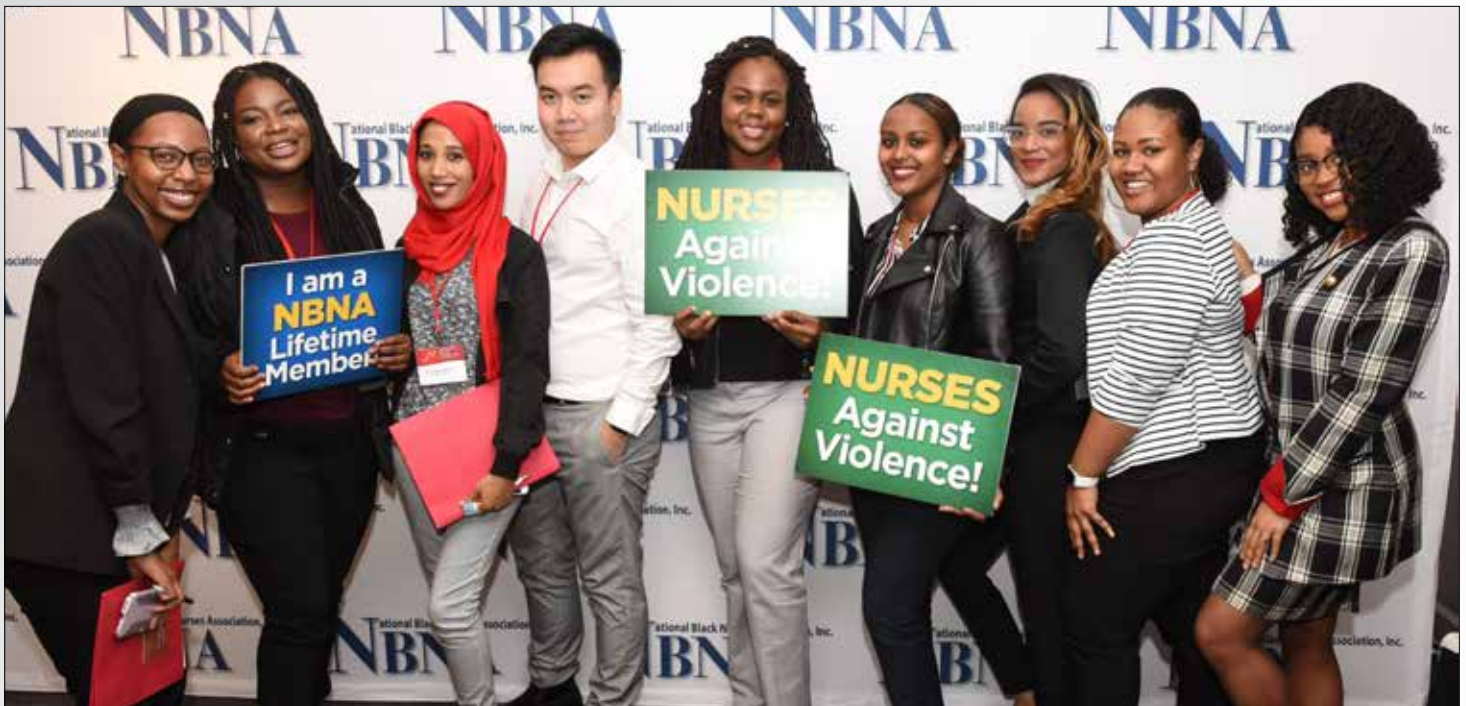
Students attending NBNA Day on Capitol Hill 2019