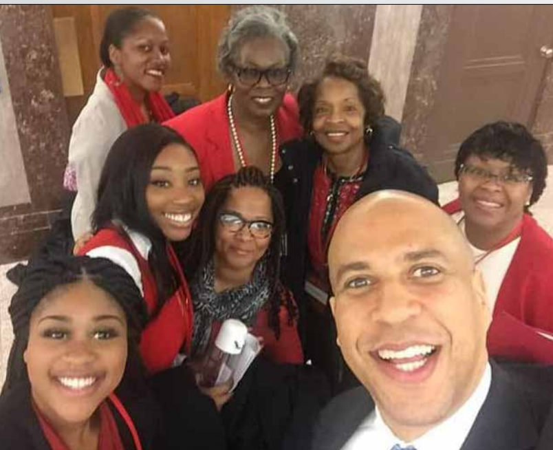
Senator Corey Booker (D-1. NJ) with NBNA Members