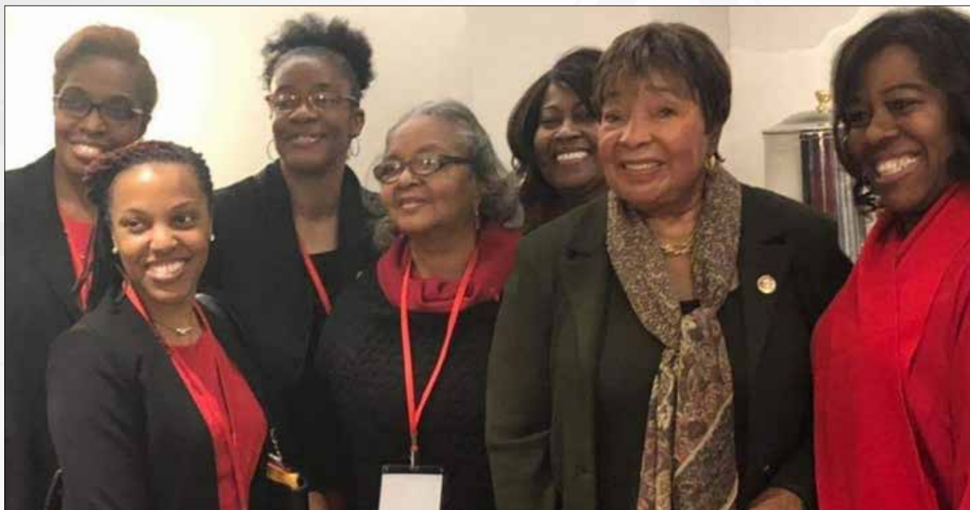
NBNA Members with Representative Eddie Bernice Johnson