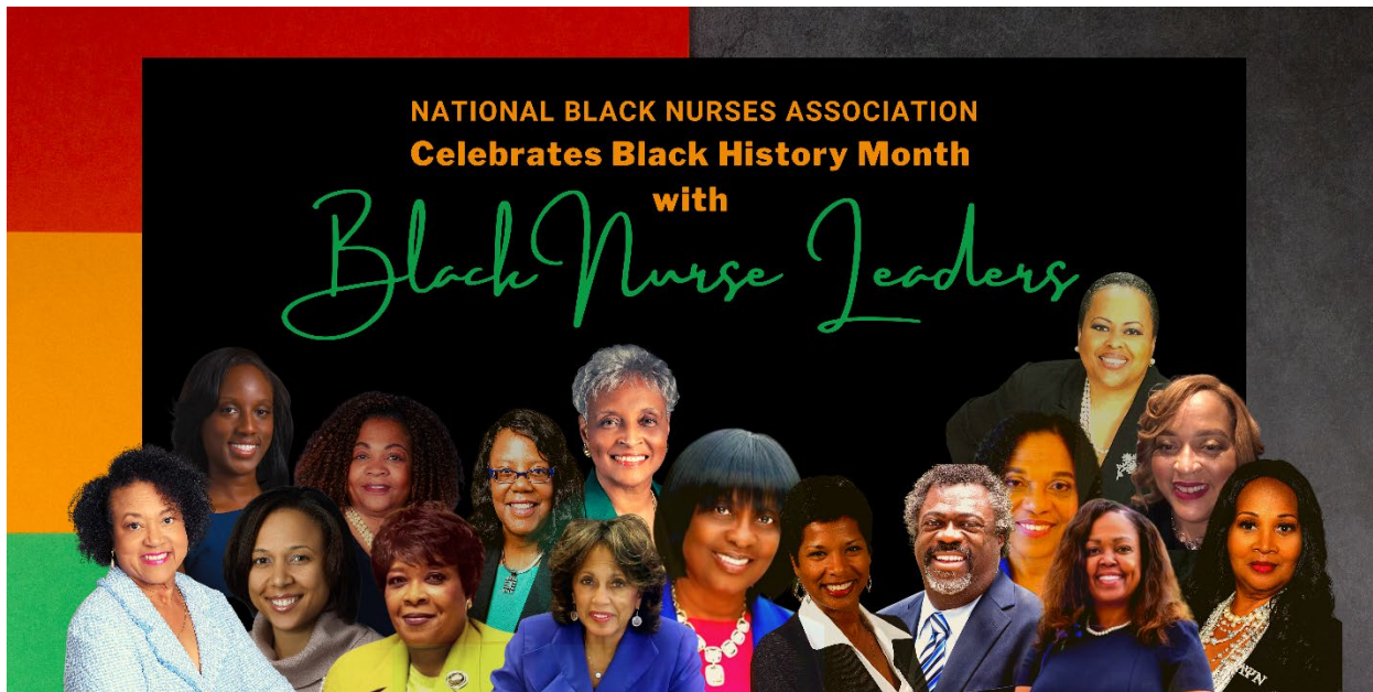
Photo Caption 2: Featured Black History Month 2022 Black Nurse Leaders