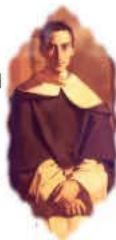
Jean-Baptiste Henri-Dominique Lacordaire 1802 - 1861