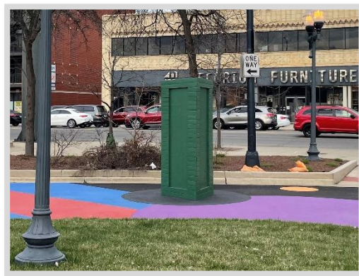
Wood Entry Pylons