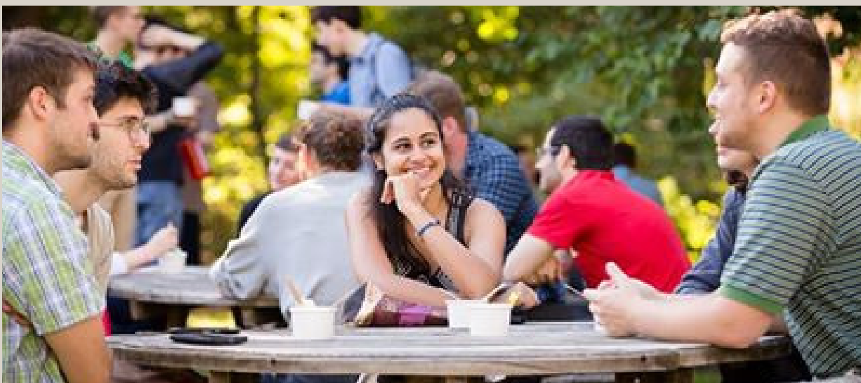
Ice Cream Social 2016