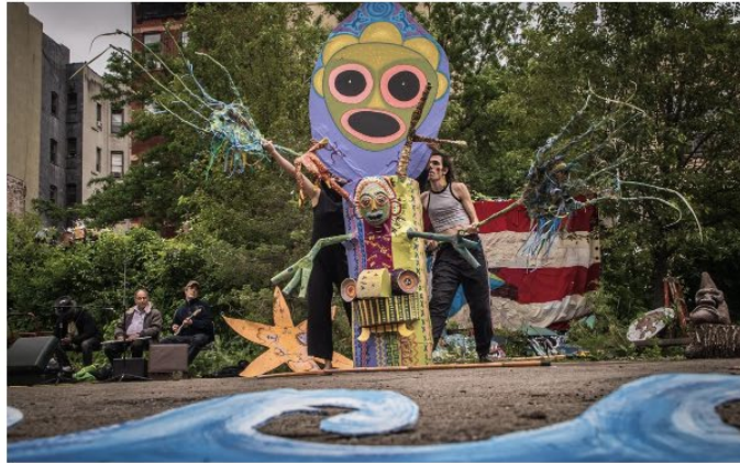
A performance from the Theater Lab of the Loisaída Festival in 2023. The celebration of Puerto Rican heritage returns on Sunday. Melvin Audaz

ARTS | What to Do in New York City in May