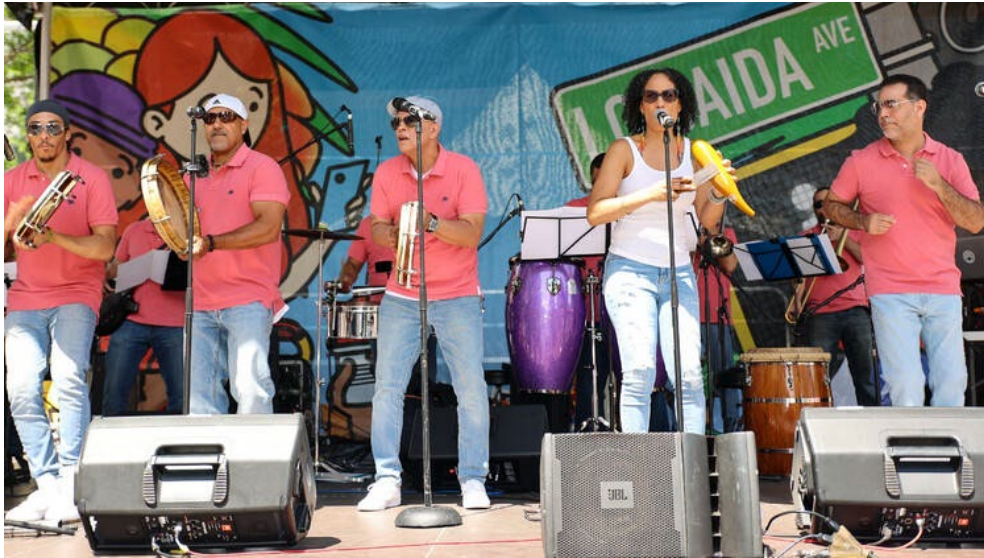
Photograph: Andrew Cirilo | Loisaida Festival

Get ready for an afternoon full of live music, dance, artisan crafts, food vendors and more at the 38th Annual Loisaida Festival.