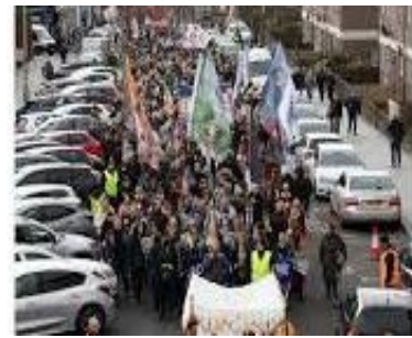
Catholic Ireland waking up. 2/1/2025