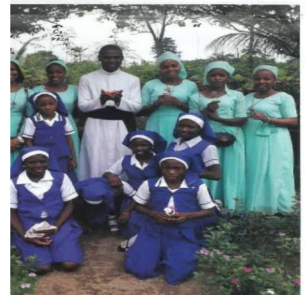
Children of the parish.