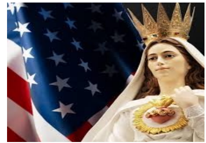
Our Lady of America