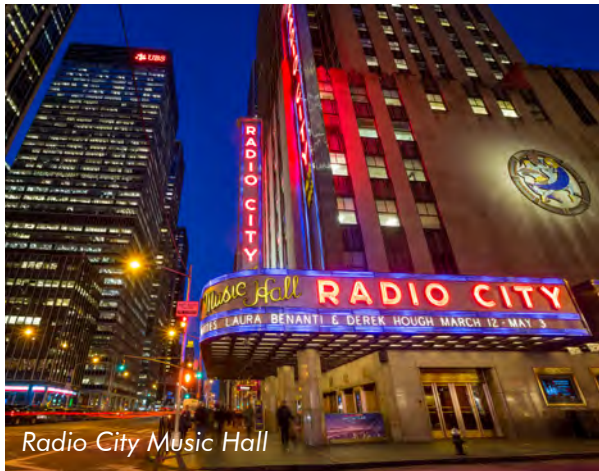
Radio City Music Hall