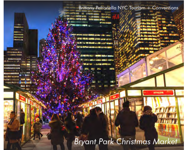
Bryant Park Christmas Market