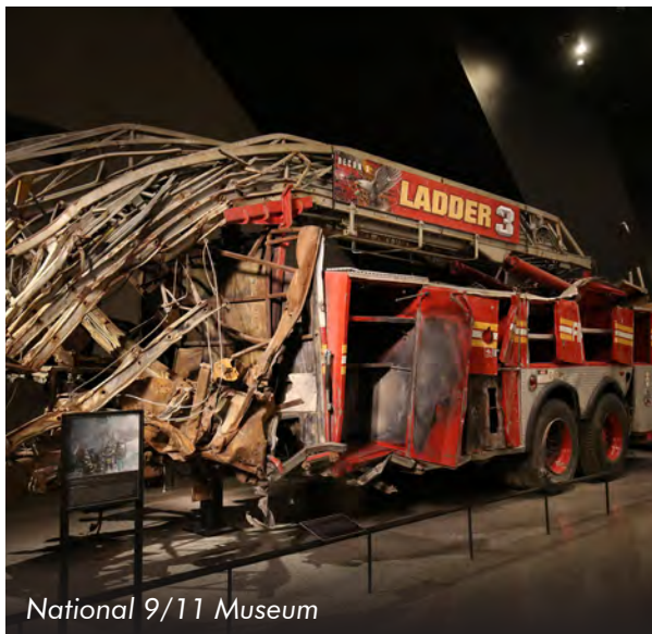
National 9/11 Museum