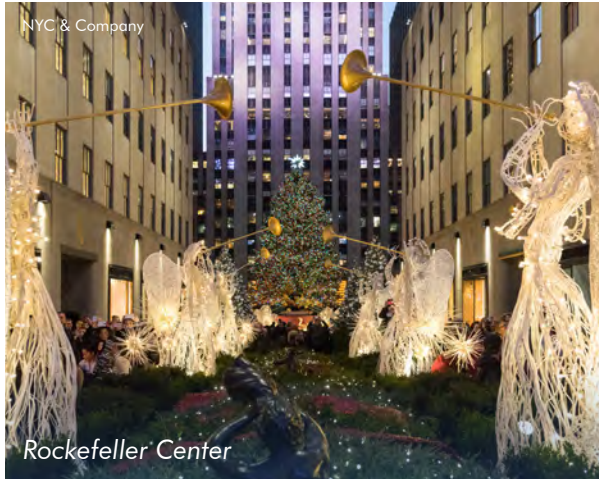
NYC & Company