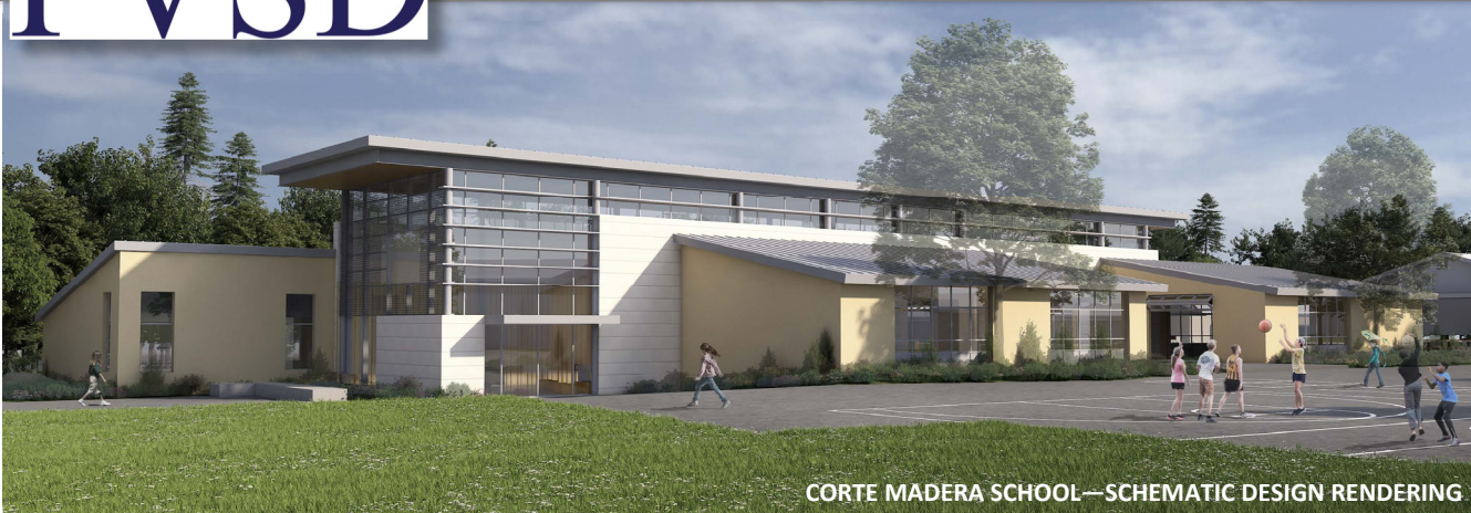
CORTE MADERA SCHOOL—SCHEMATIC DESIGN RENDERING