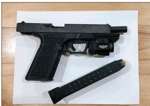
Pictured is the recovered 'ghost gun' found in possession of Miranda-Silva.