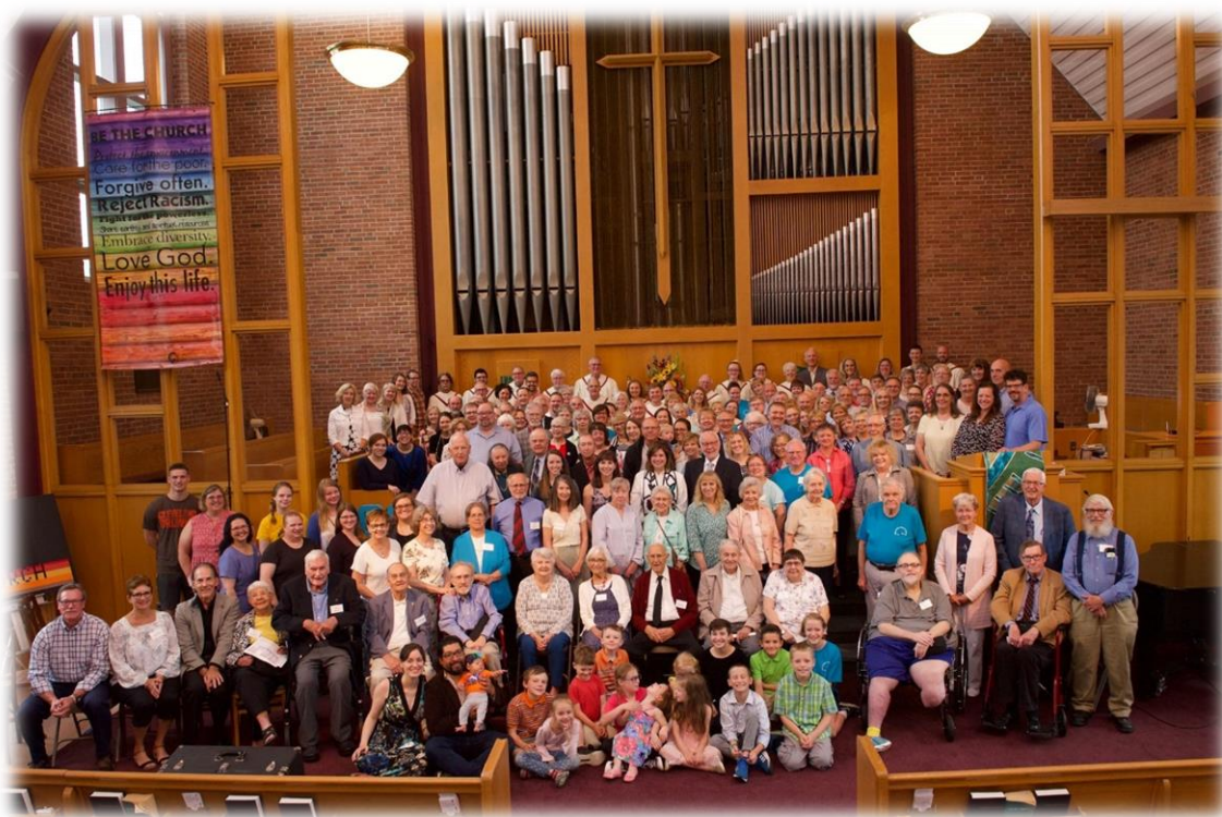
Our Bicentennial Anniversary, Founders' Day June 16, 2019.