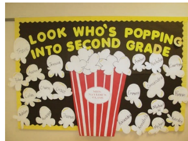
Hallway Bulletin Board