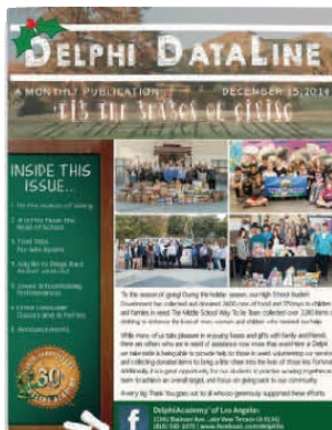
School Newsletter or Parish Bulletin