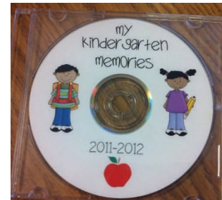
End-of the year CD