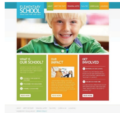
Official School Media Presence such as but not limited to website, Facebook®, Twitter®, etc.