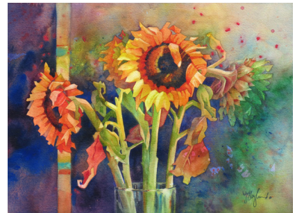
► Sunflower Blast #1