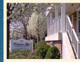
Faithfully serving over 3,500 clients.