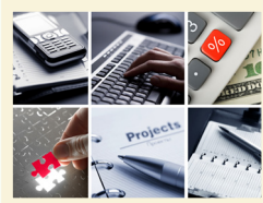
It takes skills and time to be a competent fiduciary.

Caring for elderly or disabled people can become disheartening and frustrating. It can cause emotional, physical, and financial stress. Everyone reacts differently as a caregiver and no one should be criticized for trying to provide care and later realizing they are not able to continue to act as a caregiver. Letting a professional step in is often the best and most practical solution for everyone involved.