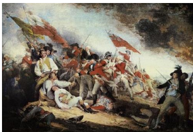
Battle of Bunker Hill painting by John Trumbull

Join us for this fascinating presentation on the American Revolution, from 1754 and the first shots of the French & Indian war, that led to the taxes, that led to rebellion, that led to the revolutionary war, that led to independence, the constitution and our first president that led to the French Revolution that led to the war of 1812!