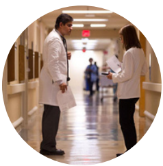
Best Practices for Delivering Learner Feedback Workshop