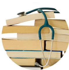
MITE Journal Club