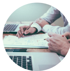
Group Manuscript Peer Review