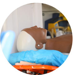
John R. Darby Simulation Grand Rounds