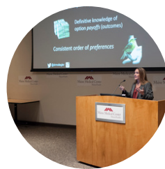
Department Grand Rounds