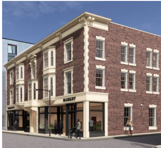
Hotel Grayson (rendering) NeighborWorks Housing Solutions