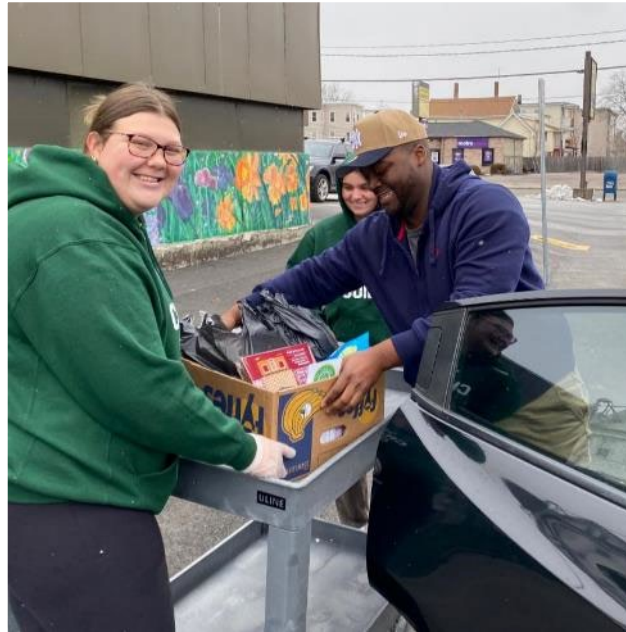
The Charity Guild