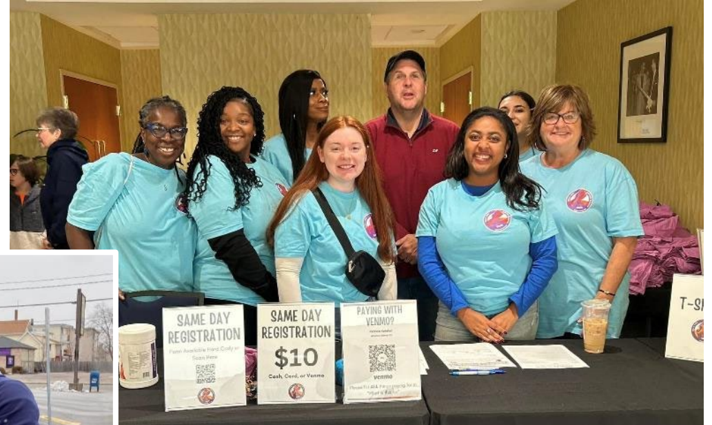
Family and Community Resources