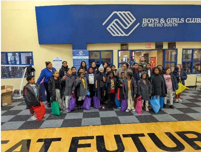
Boys & Girls Club of Metro South