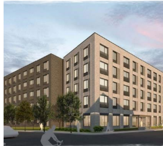
Brockton South Transit-Oriented-Development (rendering) NeighborWorks Housing Solutions