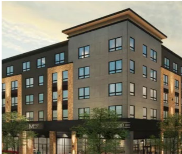
Merian on Main (rendering) Dakota Properties